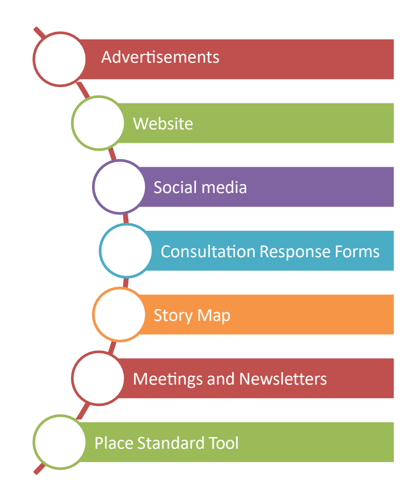
DIAGRAM 2: METHODS OF COMMUNICATION