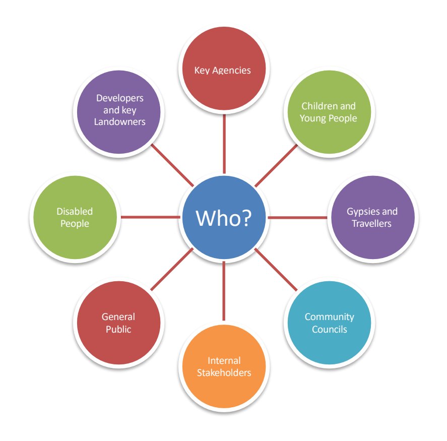
DIAGRAM 1: WHO WE WILL CONSULT

As work progresses on new or revised Supplementary Guidance, consultation with communities, relevant interest groups, Key Agencies and stakeholders will take place. This, along with national policy changes, will inform these documents, and will apply to any planning briefs prepared for housing or development sites.