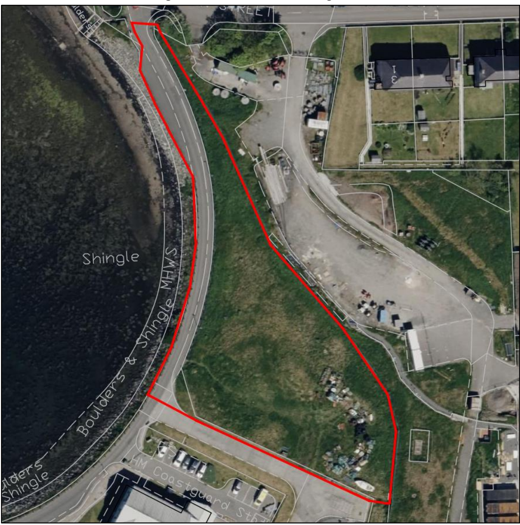
Figure 1: Current Site Aerial Image

Consulting the NatureScot Sitelink Map<sup>1</sup>, the site does not lie within any protected area. Further details of nearby habitats are given in pages 18 and 19 of the Design and Access Statement, submitted on 18 Apr 2024 (application reference: 24/00155/PPDM).