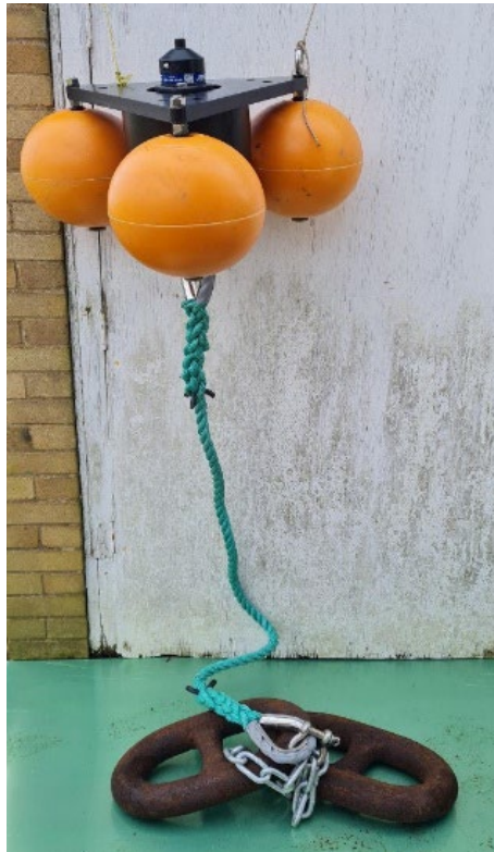
Figure1: Fish tagging receiver.

Each receiver and mooring does not extend >3m above the seabed (Figure 1: Fish tagging receiver). All receiver units are 'acoustic release' (Innovasea, AR) type with acoustic retrieval canister (ARC). There will therefore be no markers on the surface whilst the equipment is in situ. Markers will only be deployed when the equipment is to be retrieved and a work vessel is on site to retrieve the equipment.