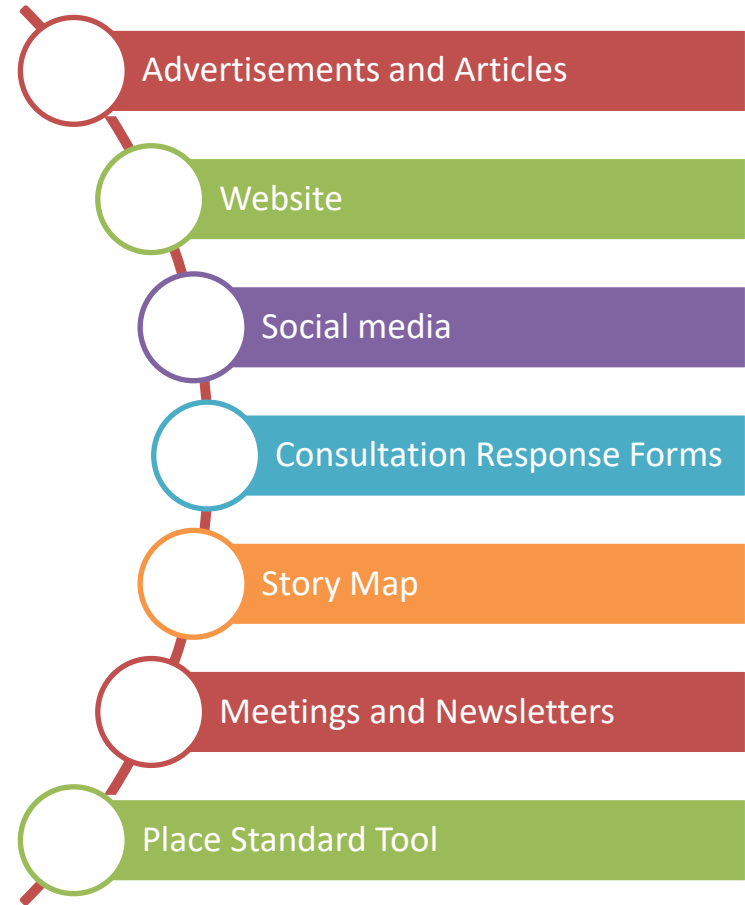
DIAGRAM 2: METHODS OF COMMUNICATION