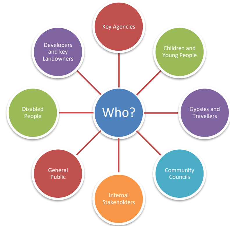
DIAGRAM 1: WHO WE WILL CONSULT

As work progresses on the reviewed and new Supplementary Guidances, consultation with communities, relevant interest groups, Key Agencies and stakeholders will take place. This, along with national policy changes, will inform these documents, and will apply to any planning briefs prepared for housing or development sites.