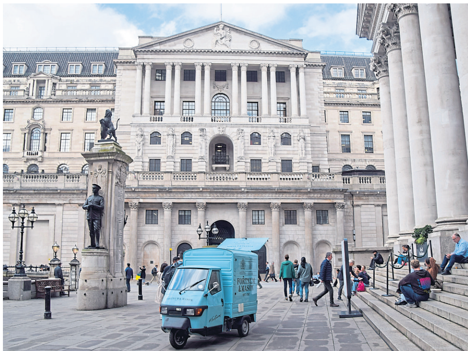
PLAN: Proposal is to enable the Bank of England to direct payments to a failing bank.