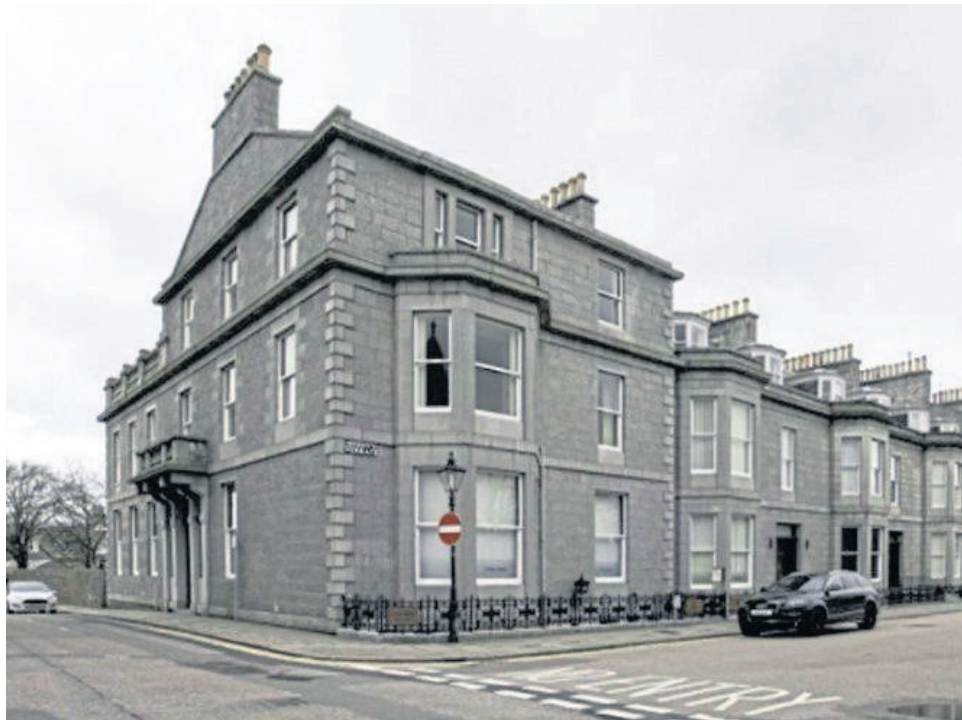
FOR SALE: The former abrdn office in Aberdeen's West End.