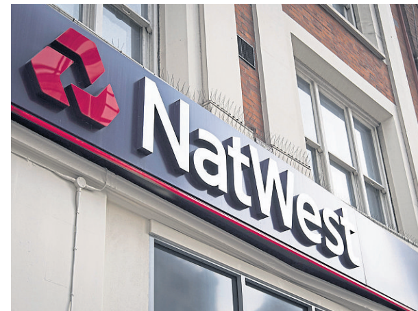
NatWest's shares hit their highest level for a decade.

weaker as investors sought security in Treasury bonds, helping bring down the yield on 10-year bonds.